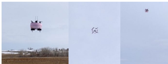
Figure 2. Titan Ringlet Drone in Hover (left), Transition Flight (center), and Cruise Flight (right).

As part of the current development effort, we have fabricated and demonstrated performance of a motor at conditions similar to the surface of Titan, about 90 K. We have also developed a flight controller for vertical, transitional, and horizontal flight and demonstrated control and measured power consumption through flight testing (Figure 2).